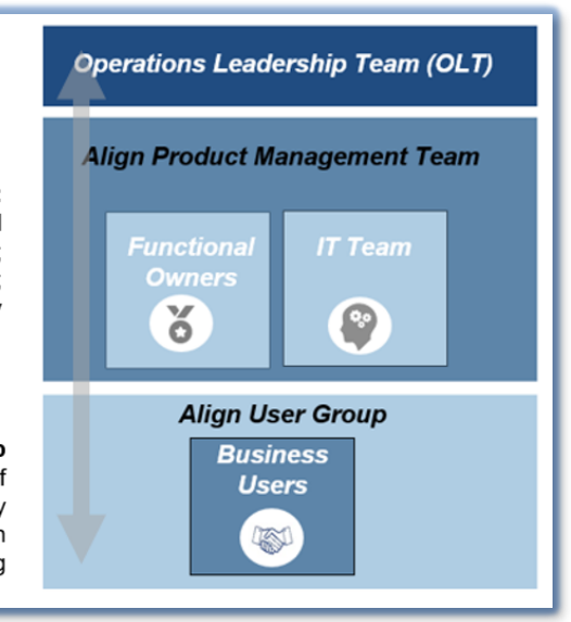
Figure 1.1: Governance Model

Represents region and registered entity end users of Align and ERO SEL; provides input into functionality and business needs; supports project delivery through requirements definition and user acceptance testing